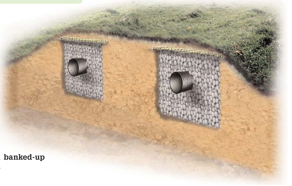
Figure 3. Section through a banked-up percolation trench.

Commissioning by a competent person should be carried out after installation and this service is available from the installer or designated service provider.